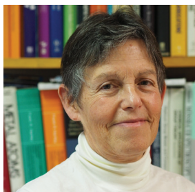
Prof. Odile Eisenstein France

In recognition of your significant contributions to modern mathematical statistics, in particular the field of optimal algorithms for statistical estimation in the presence of noise and efficient techniques for sparse representation and recovery in large data sets; and in gratitude for your friendship and cooperation with Technion and its faculty.