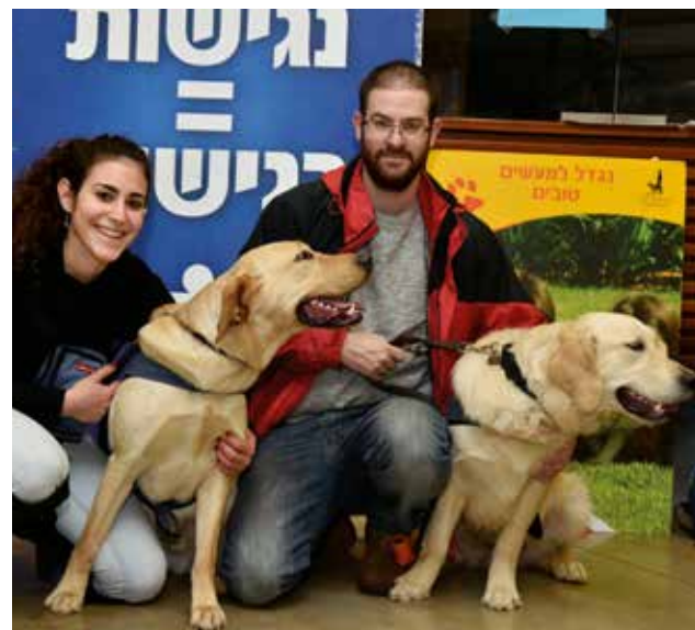
Students at the "Experiencing Accessibility" event on campus